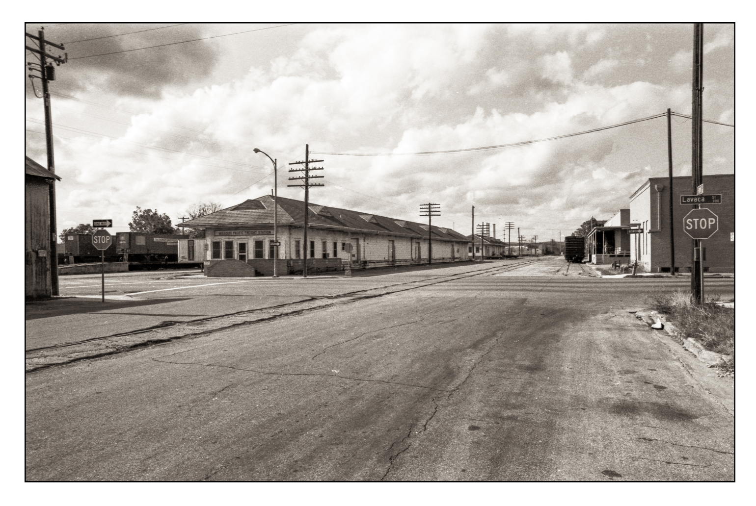
Third at Lavaca Street facing west. Missouri Pacific Freight Station.